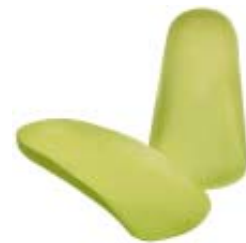
Conformer 3/4 HD (High Density)

The Conformer HD is one piece of extra firm material molded into our design. It can be ground or posted and is used when customizing is needed as an option, or when the weight of the patient is a concern. Red packaging.