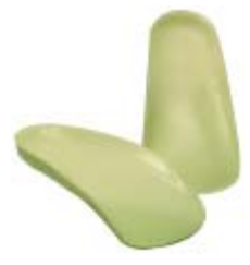
Conformer 3/4 DD (Dual Density)

The Conformer DD is a combination of two materials with the top surface firmer than the bottom. This combination gives comforting support through the bottom shell and biomechanical control from the top layer. The Dual Density is usually chosen as a Sports Orthotic for control as well as for comfort.