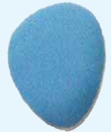
(not actual size)

Apex ppt™ lightweight, self-adhesive components that provide extra support or cushioning. Adheres quickly to other materials. Easy way to customize orthotics to meet patients' needs. One dozen per bag. Sizes: Small, Medium or Large.