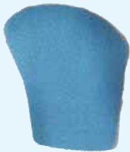
(not actual size)

Apex ppt™ self-adhesive components are lightweight and often recommended when extra support or cushioning is required. They adhere quickly to other materials and are an easy way to customize orthotics. One dozen per bag. Sizes: Small, Medium or Large.